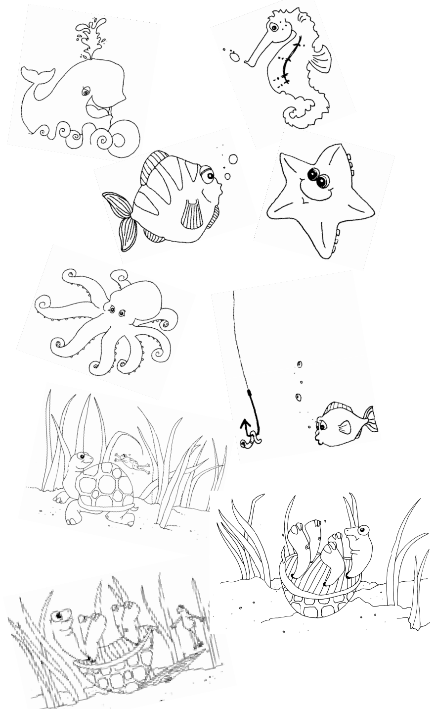
Graphics from iCLIPART professional license, Books for Results, Inc.